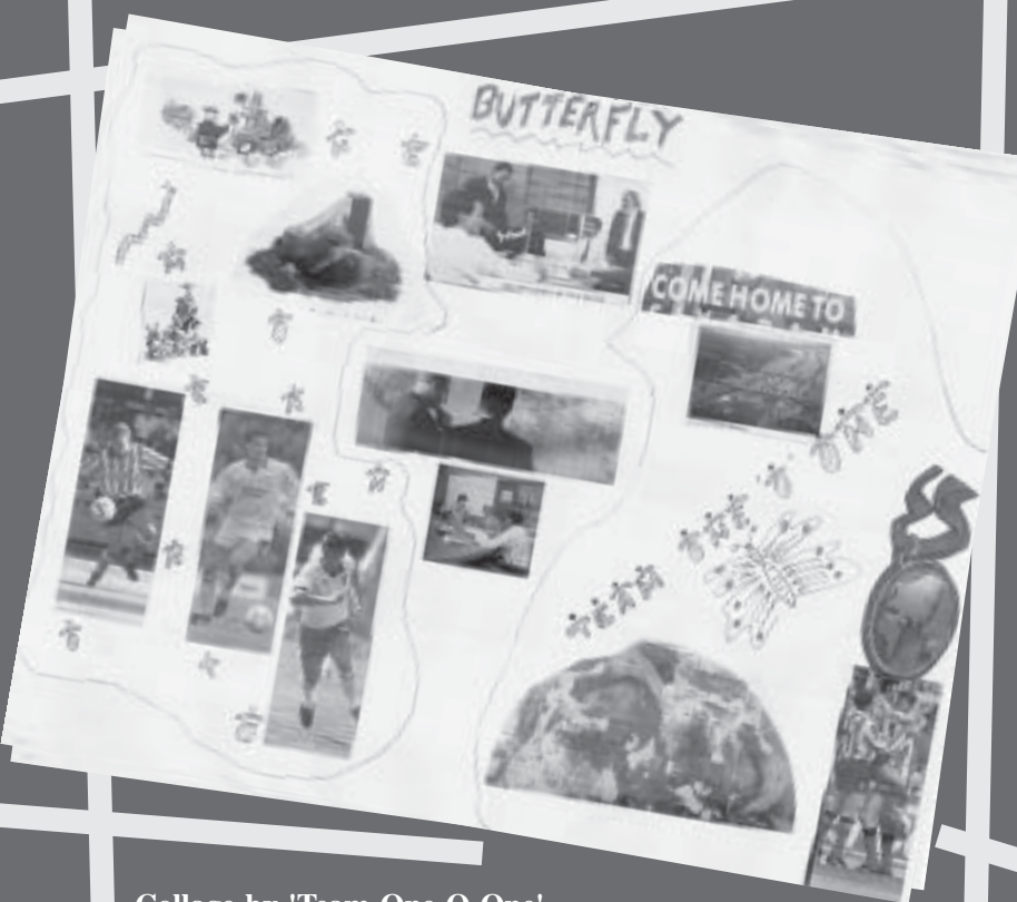
Collage by 'Team One O One'