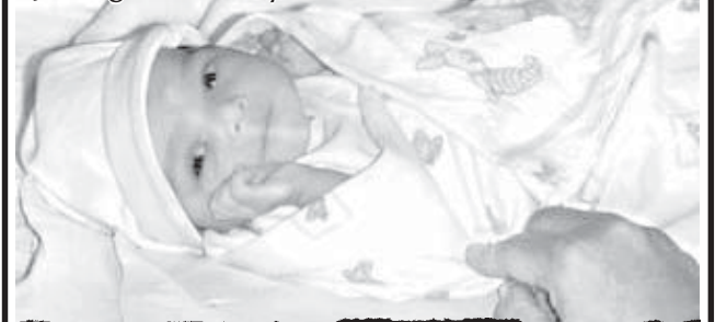
PROOF Baby Girl