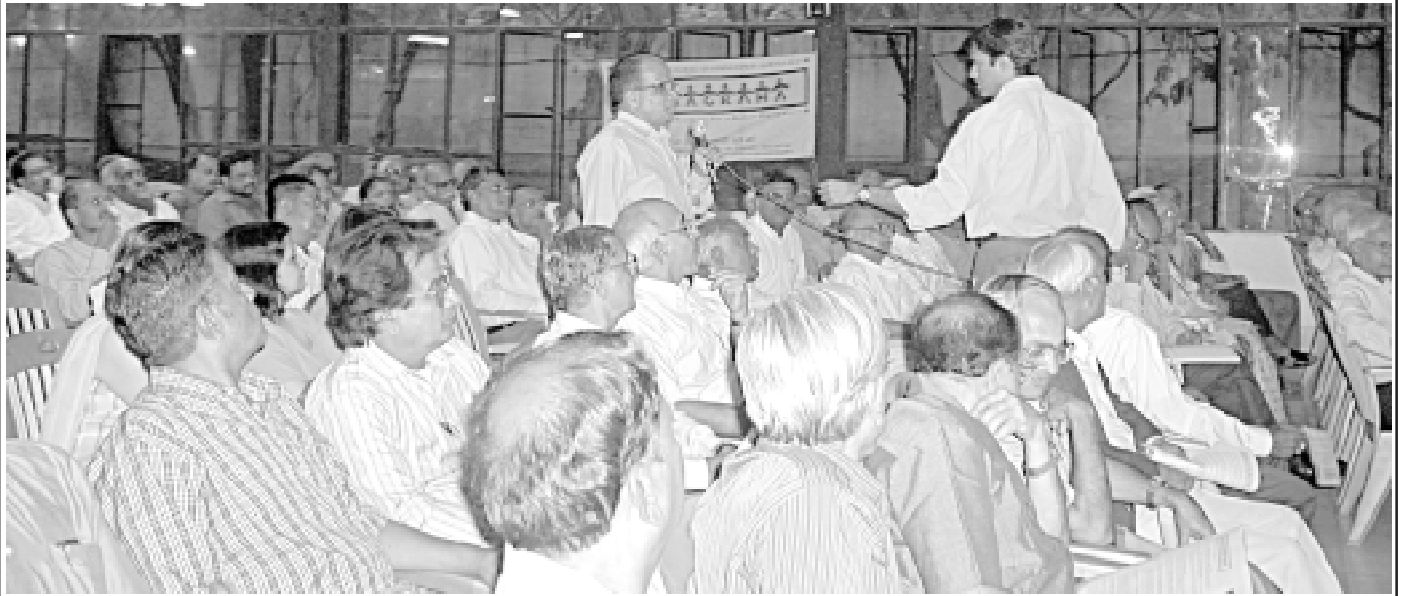
Janaagraha Interaction between Citizens Associations and BMP officials at Century Club on August 28