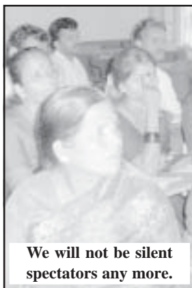
We will not be silent spectators any more.

“W e cant come out of our houses after six in the evening, because of misbehaviour by drunkards on the street. Eve-teasing is rampant,” said a woman from a slum in Hebbal. She was one of the 250 participants in Janaagraha-sponsored workshop for the urban poor held in