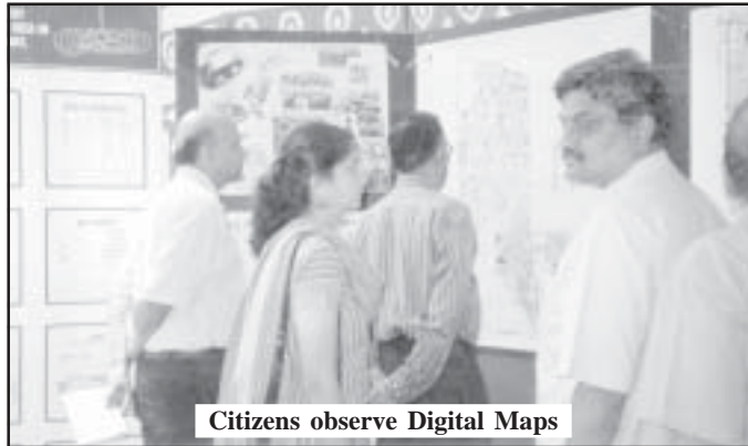
Citizens observe Digital Maps

individually, and as representatives of the resident associations at wards 50, 54, 94 and 100, sat down for more than 4 hours and methodically listed out their concerns on 26 issues from roads to building violations and land encroachments, not by showing their lung power, but marking it on their neighborhood maps, especially prepared by Janaagraha as a central planning devise.